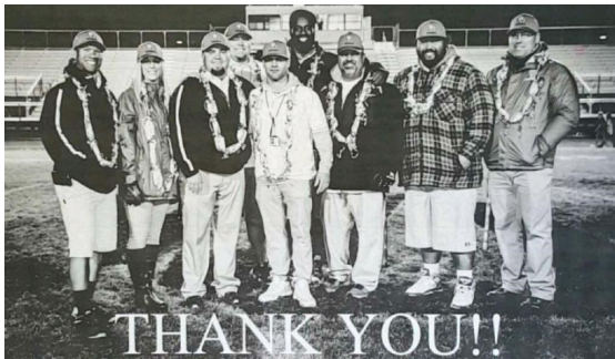
WEST JORDAN HIGH SCHOOL Coach of Football, Track, and Cross Country

In my career, I have had the opportunity to be a 7 th , 8 th , 9 th grade Science Teacher, Head Coach, Coach, and Assistant Principal. Before becoming an Administrator, I taught MELP and C&A at Clayton and Glendale Middle School. Just like Bonneville, the students I taught have always had very high growth and proficiency scores in my classroom. Three years ago I left Clayton to become the Assistant Principal at Meadowlark Elementary. Over the past three years I have been effective in changing student behavior, culture, and academic success for all students. Student success was apparent in the hallways, lunchroom, recess, and on the end of the year state tests. This year I was Salt Lake School District's National Outstanding Assistant Principal of the Year.